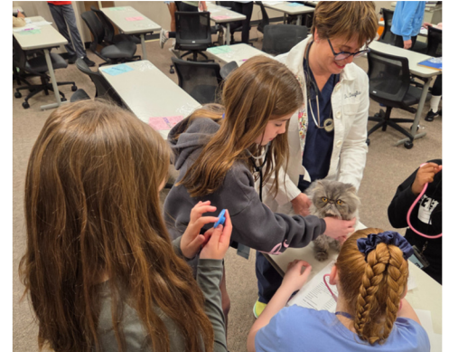
Students in the veterinary science session perform an examination on a cat.

SparkPath presents its programs in collaboration with BrightWorks, a Minnesota Service Cooperative. BrightWorks members save 34% on program registration fees. Scholarships are available.